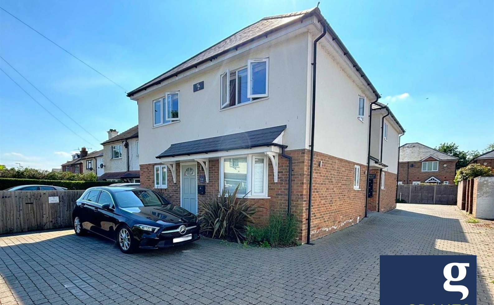
12 Woodham Lane, New Haw, KT15 3EH