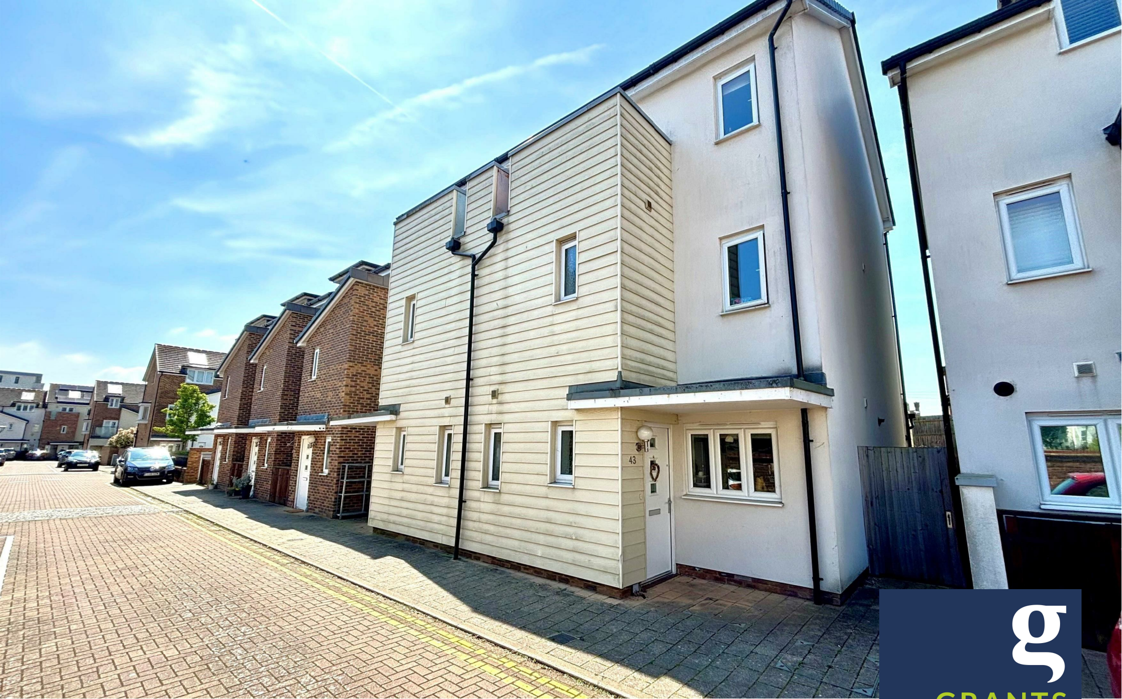
Pyle Close, Addlestone, KT15 2FF