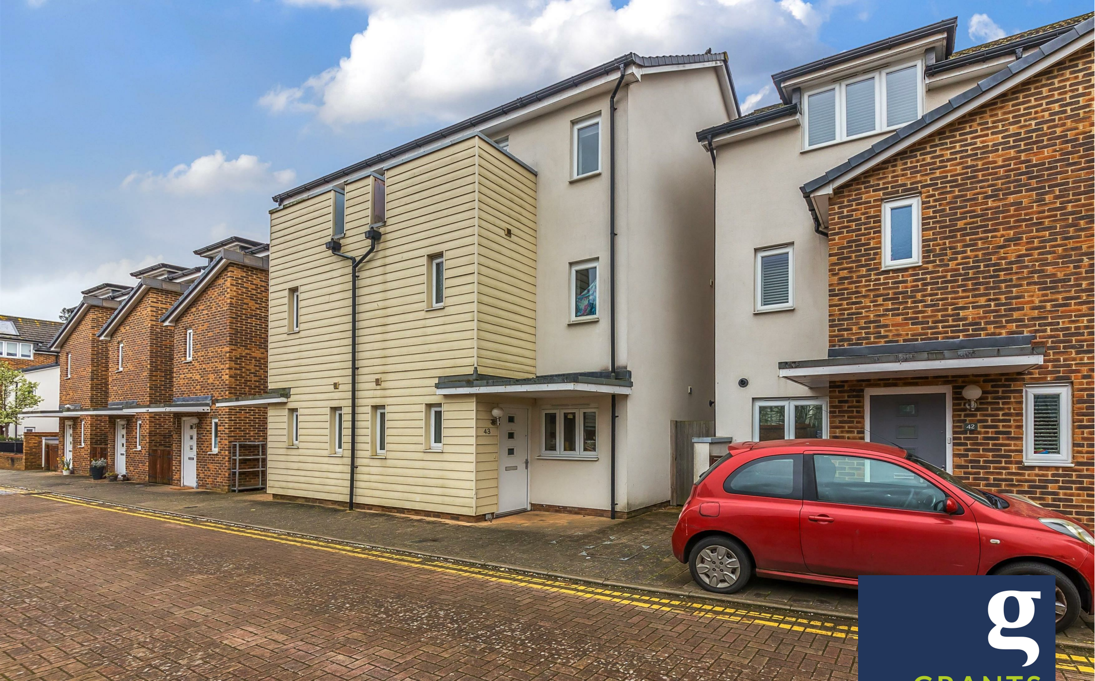
Pyle Close, Addlestone, KT15 2FF