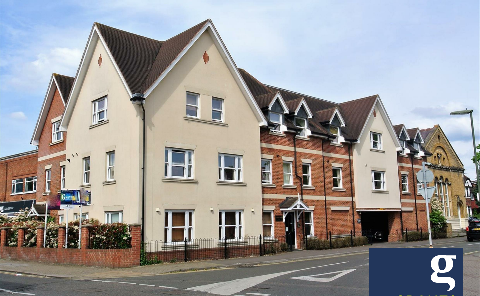
Crouch Oak Lane, Addlestone, KT15 2NT