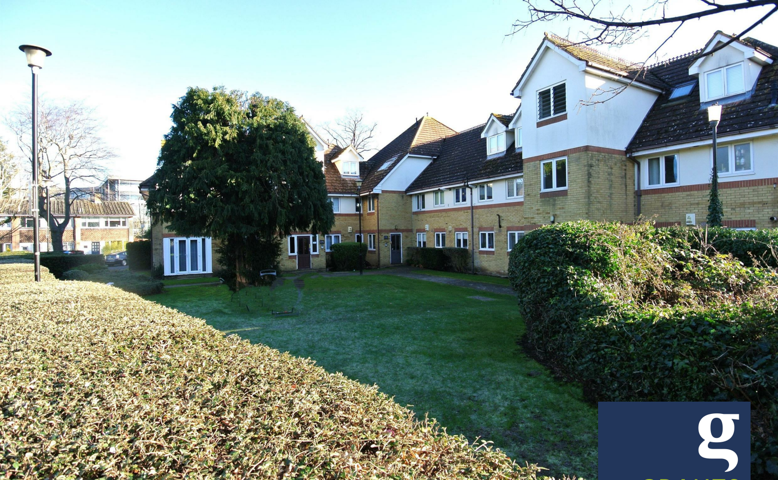
Burn Close, Addlestone, KT15 2PJ