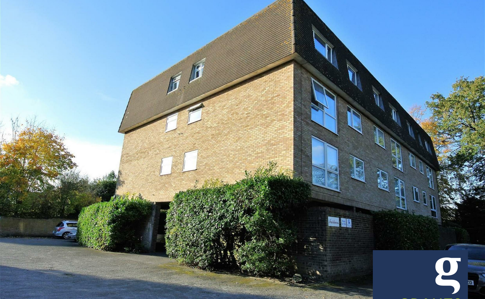
Addlestone Park, Addlestone, KT15 1SU