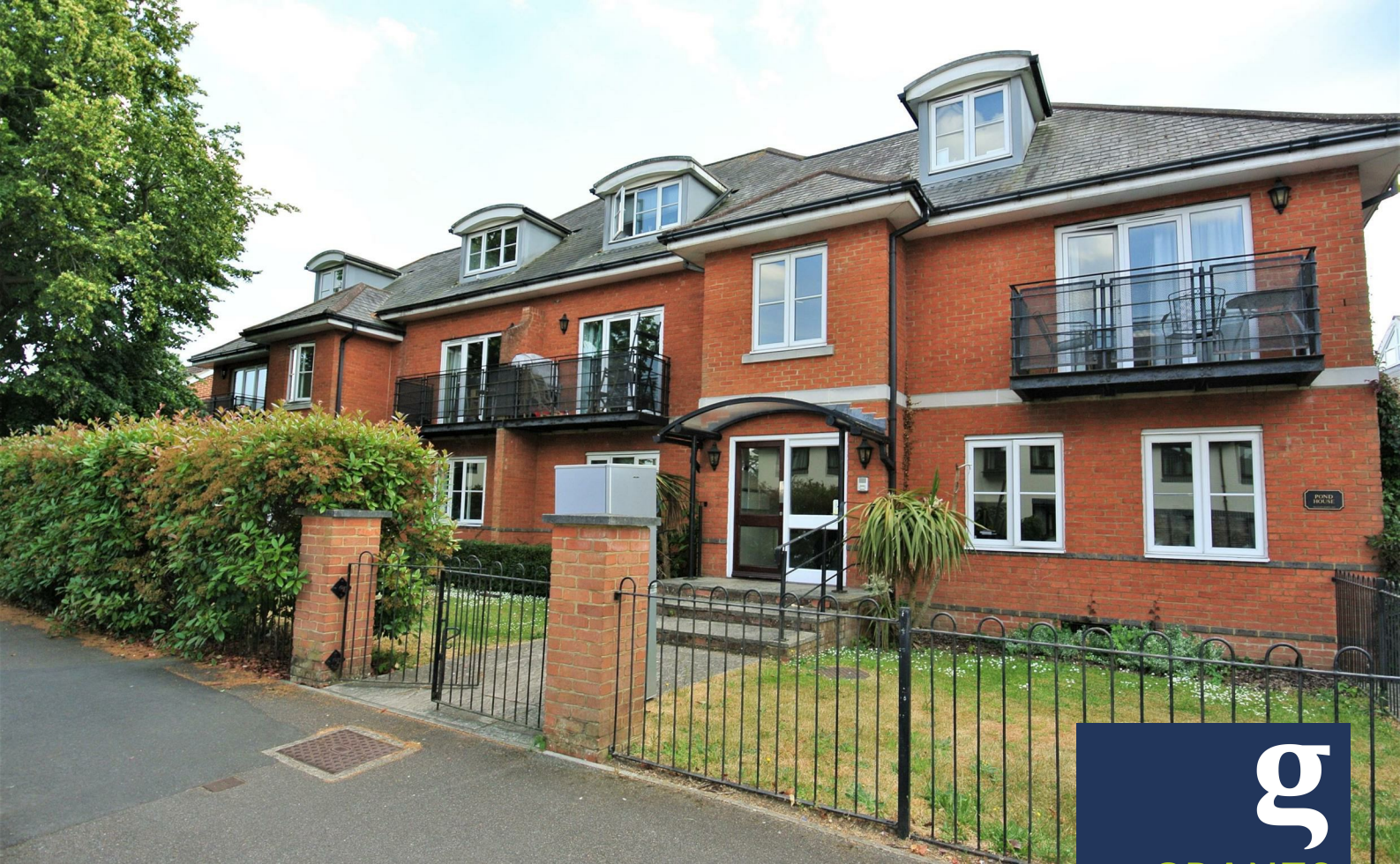
Pond House, Abbey Road, Chertsey, KT16 8AL