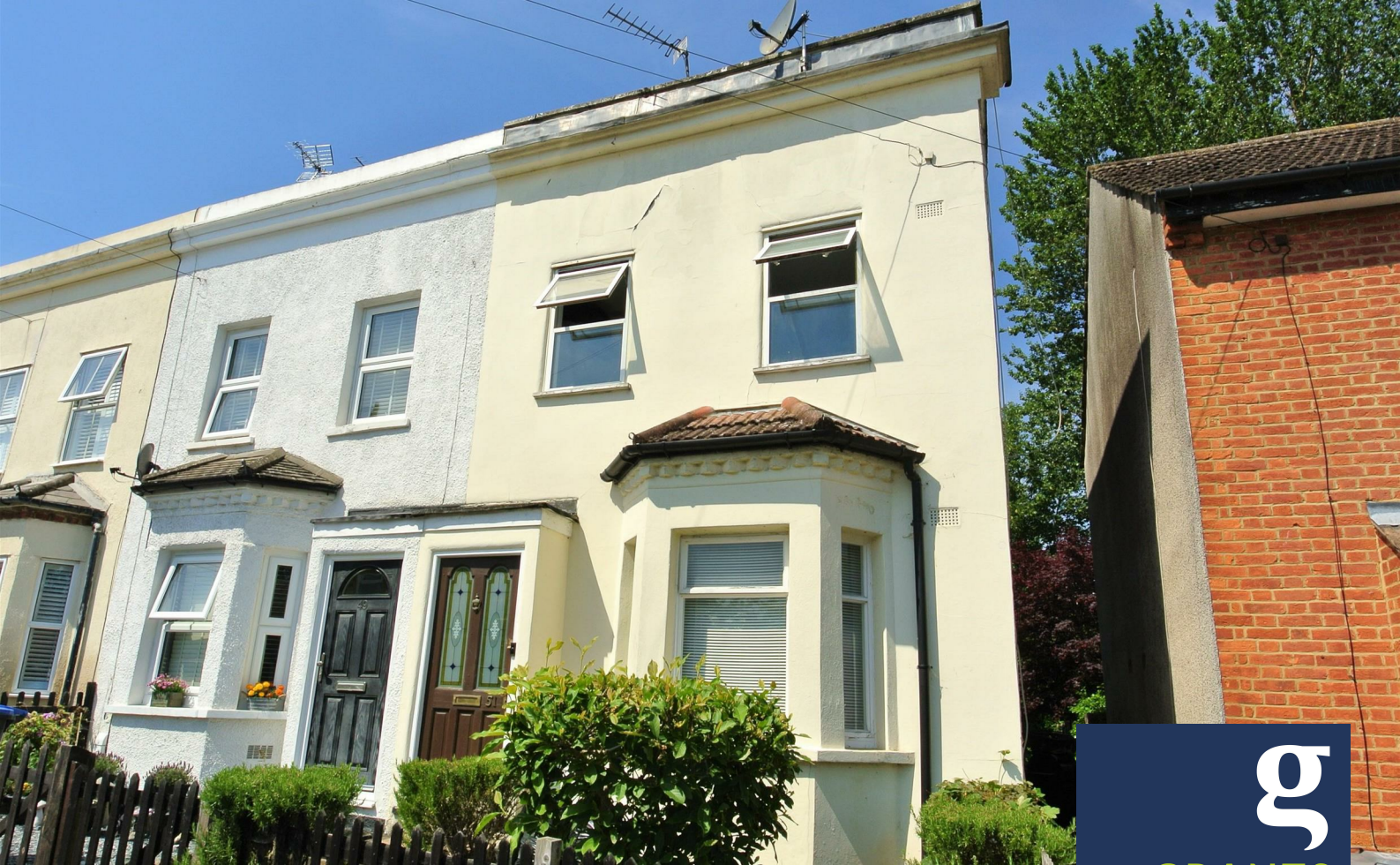
Chapel Park Road, Addlestone, KT15 1UJ