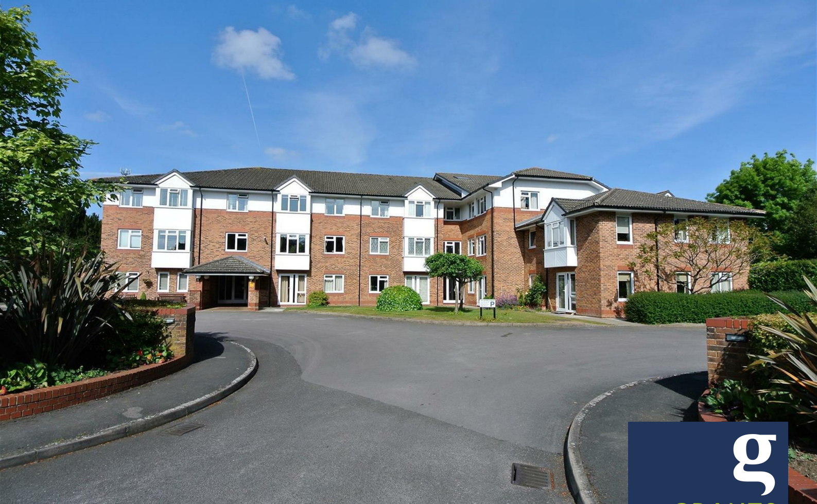
Cedar Court, Crockford Park Road, Addlestone, KT15 2LO