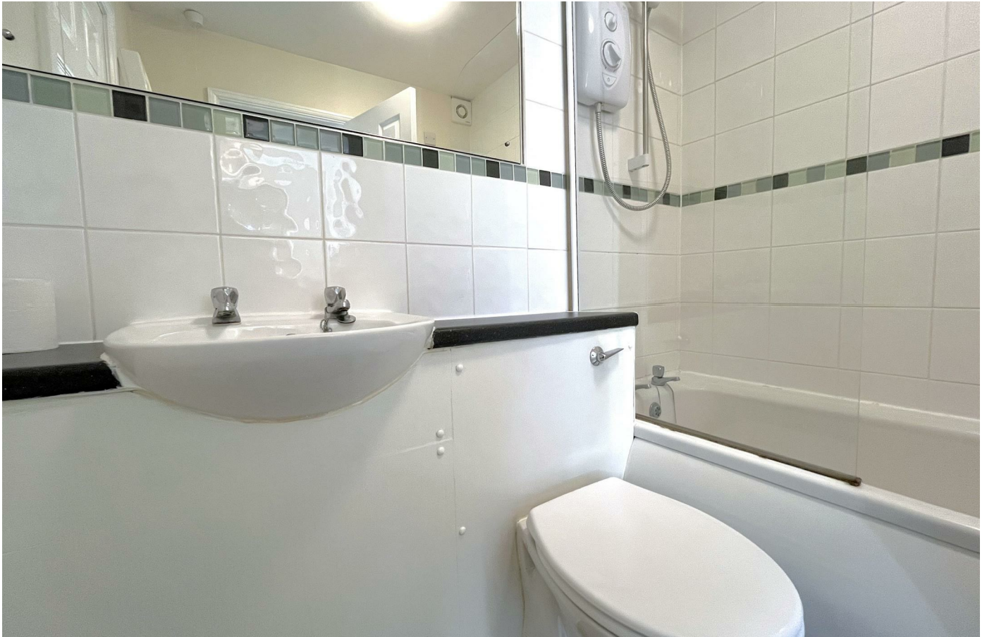
8 Wallace House, Lammas Walk, Warwick, CV34 4UX