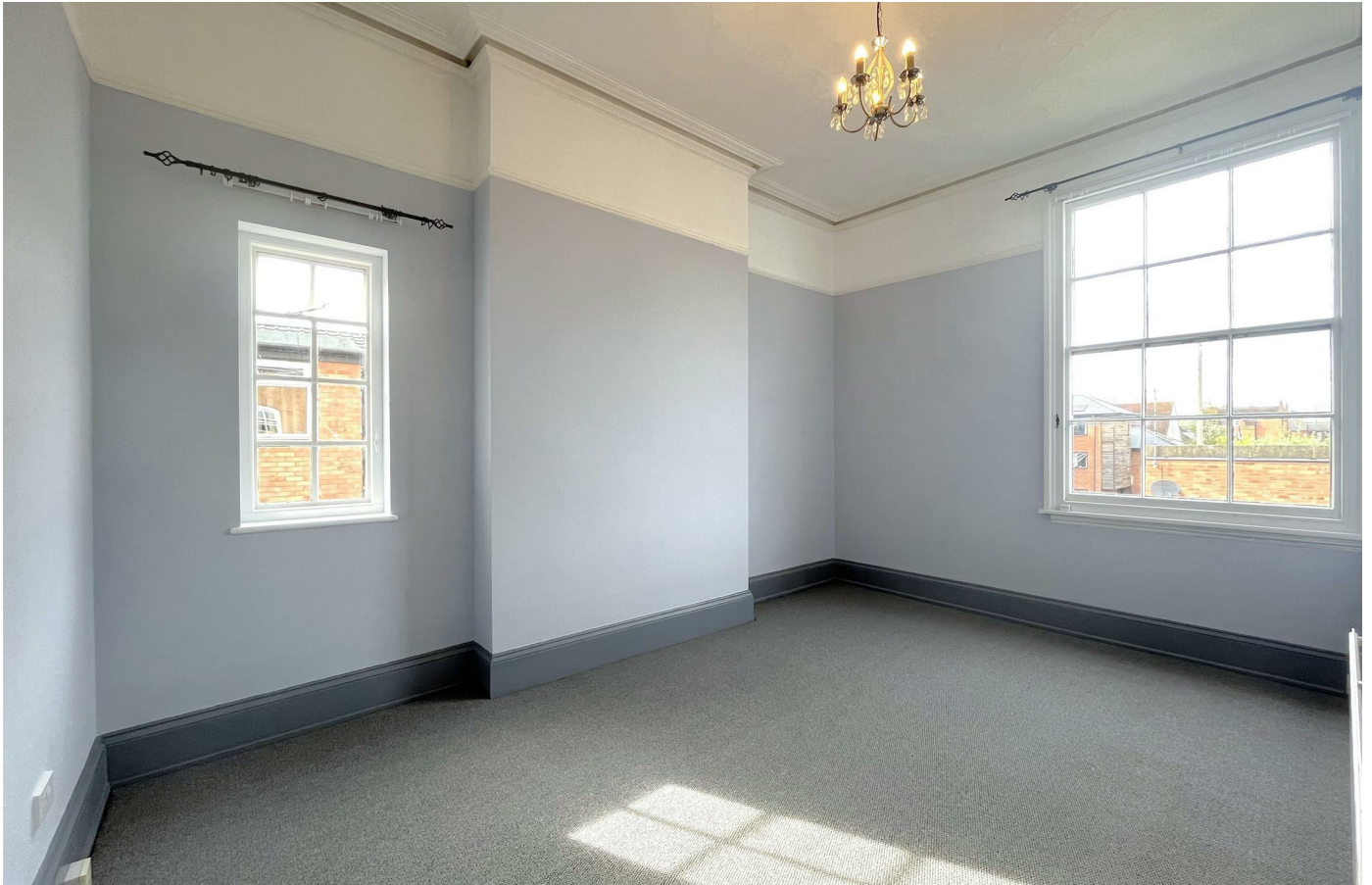
Flat 4 Dormer House, 55 Binswood Avenue, Leamington Spa, CV32 5B7