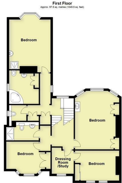
First Floor Approx. 97.5 sq. metres (1049.5 sq. feet)