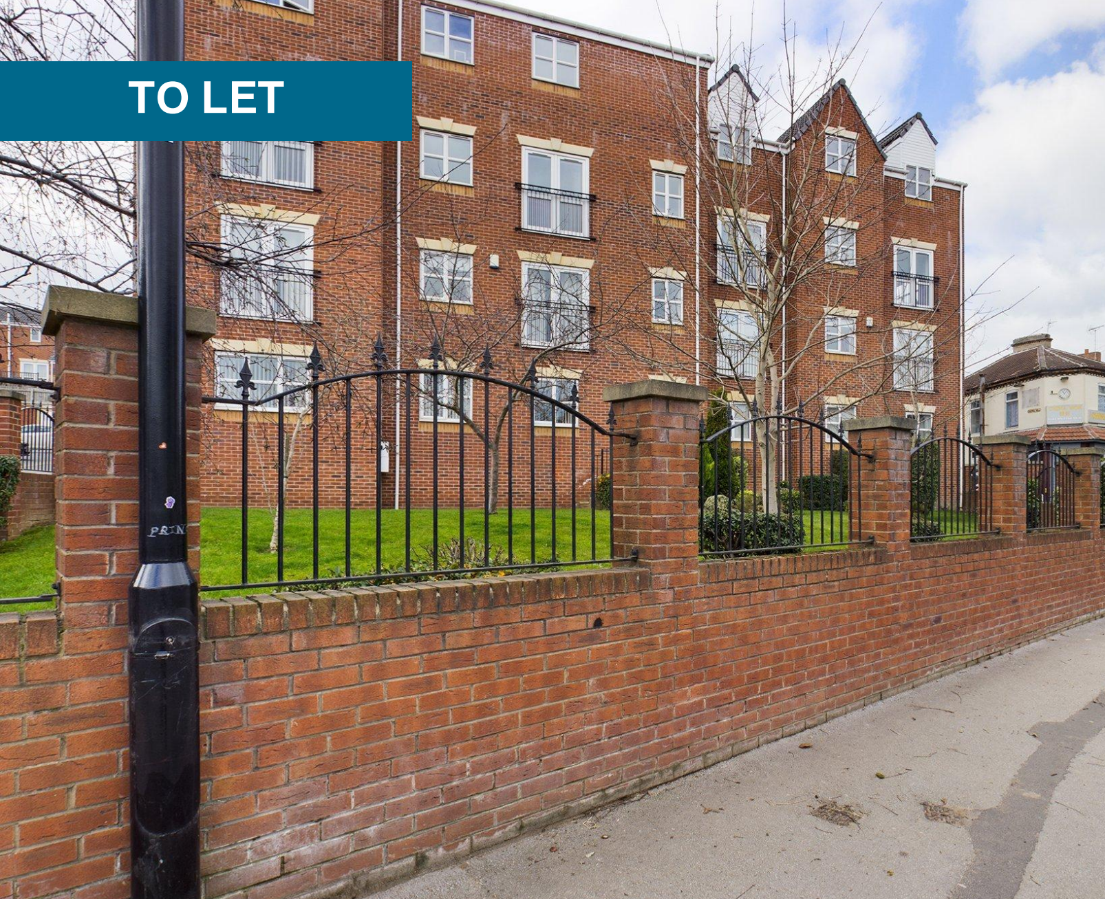
Bewick House , Askern £660 pcm