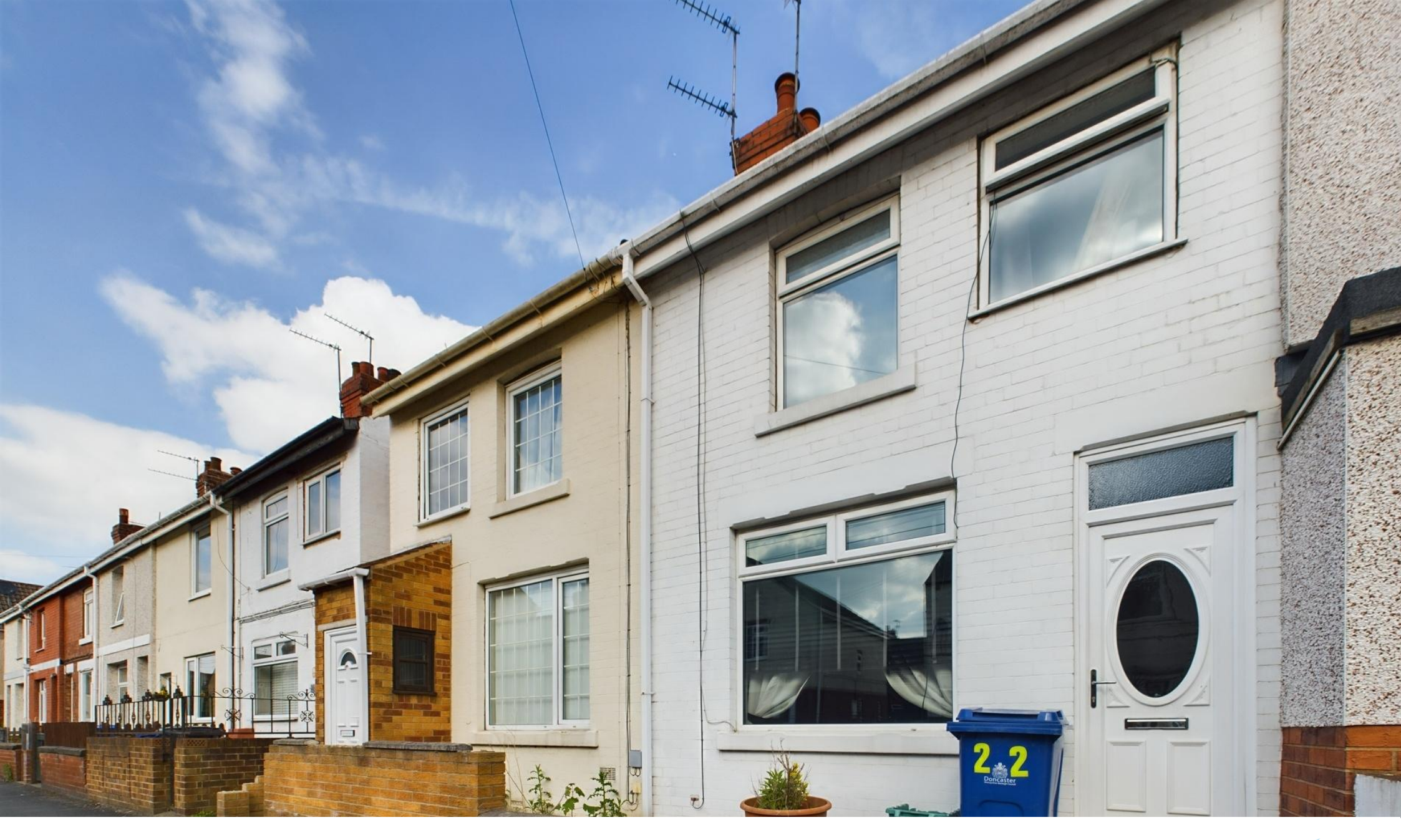
22 Queens Road , Doncaster , DN6 0LX Offers In Region Of £100,000 Freehold