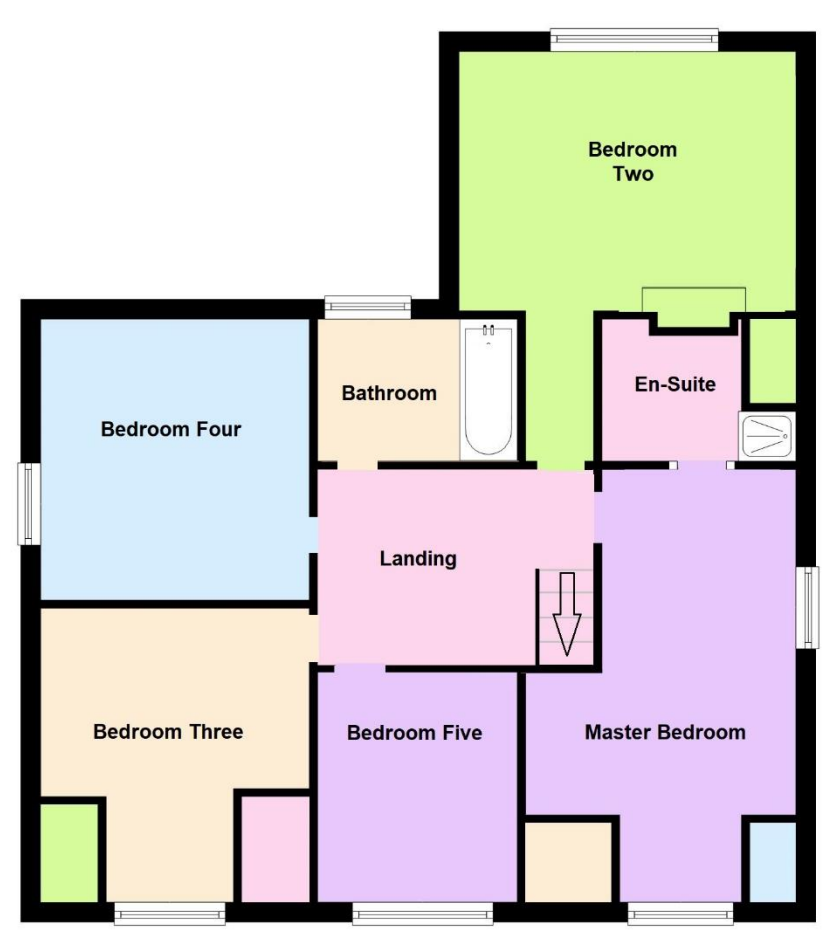
Total area: approx. 173.4 sq. metres (1866.8 sq. feet)