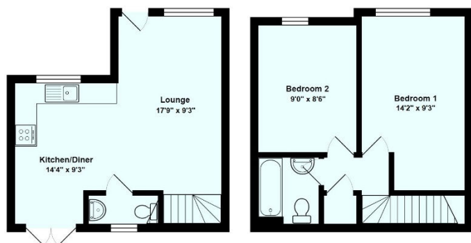
10 Privet Road