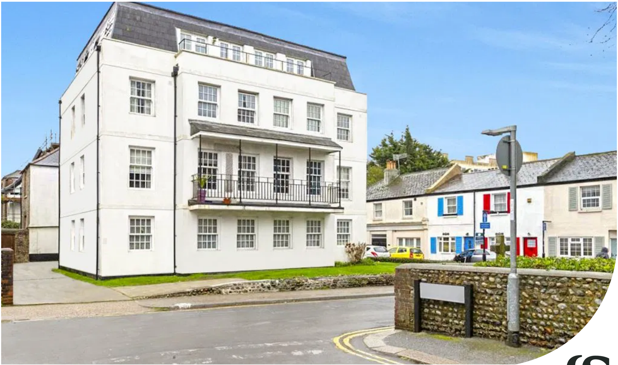
Grosvenor House, Ambrose Place, Worthing, BN11 1PZ £265,000