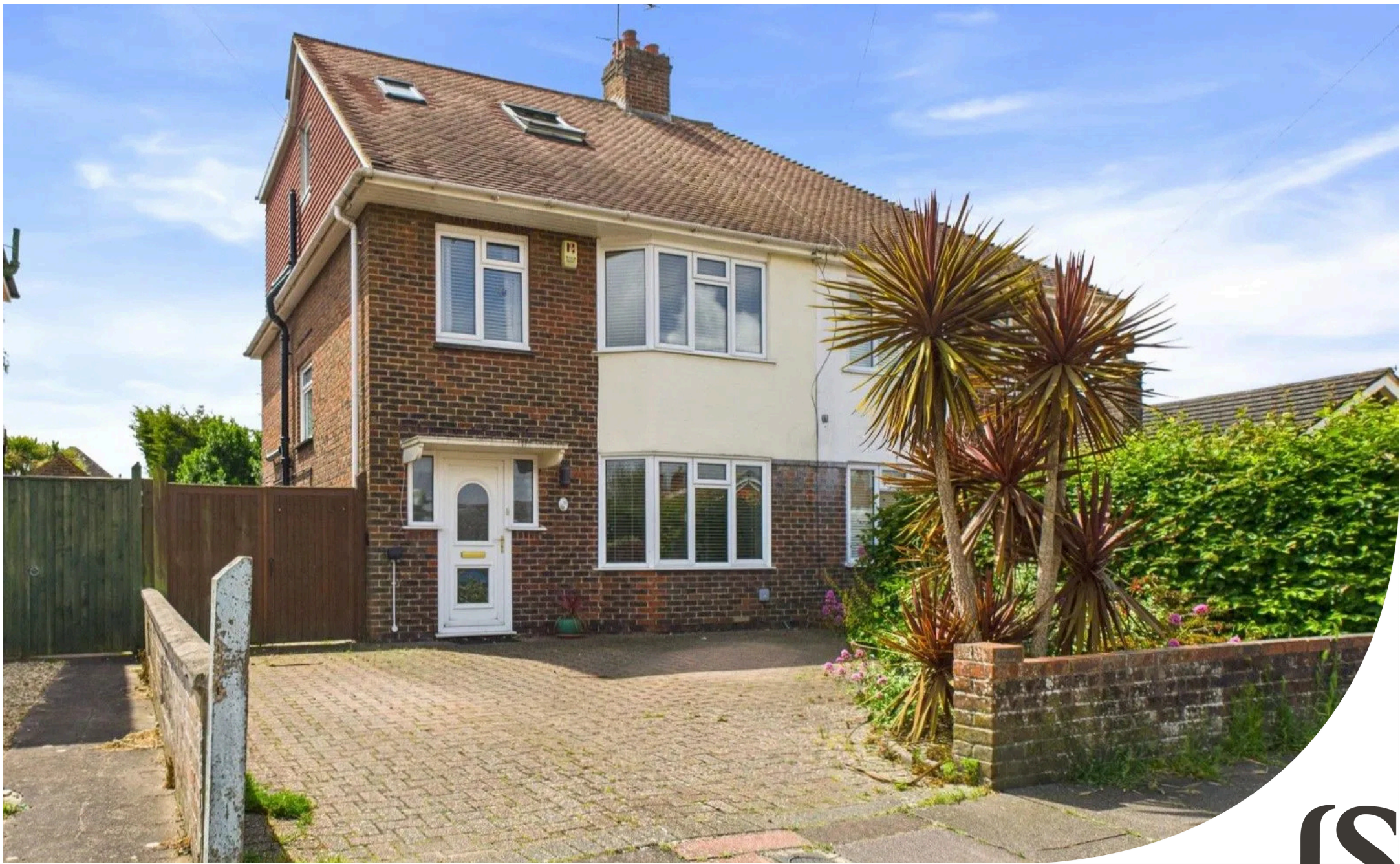
Orchard Avenue | Thomas A'Becket | Worthing | BN14 7QG Offers in the Region of £575,000