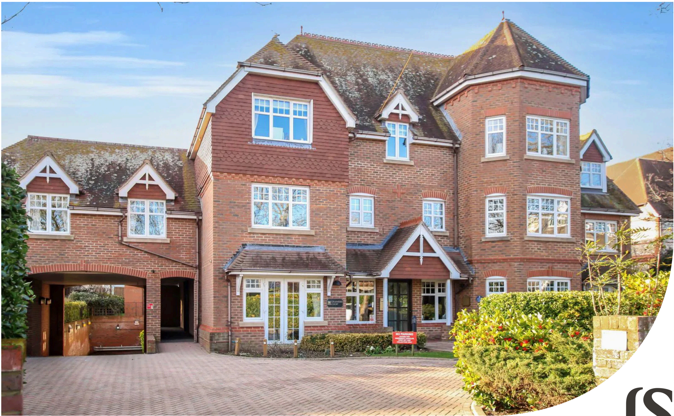
Grasmere Court | Wordsworth Road | Worthing | BN11 3JE £250,000