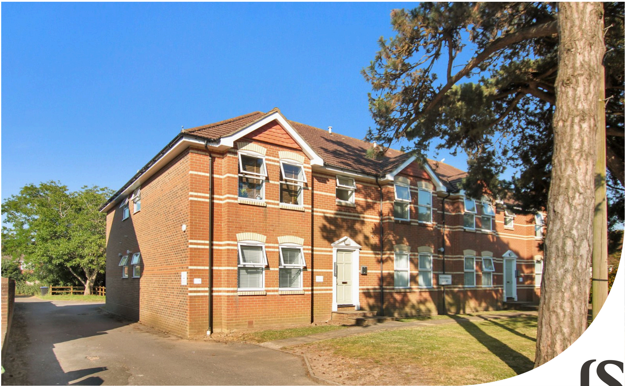
Woodsdale Court | Dominion Road | Worthing | BN14 8JQ Guide Price £185,000