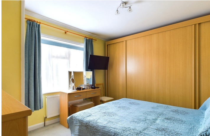
Property details: Brittany Road | Worthing | BN14 7DZ