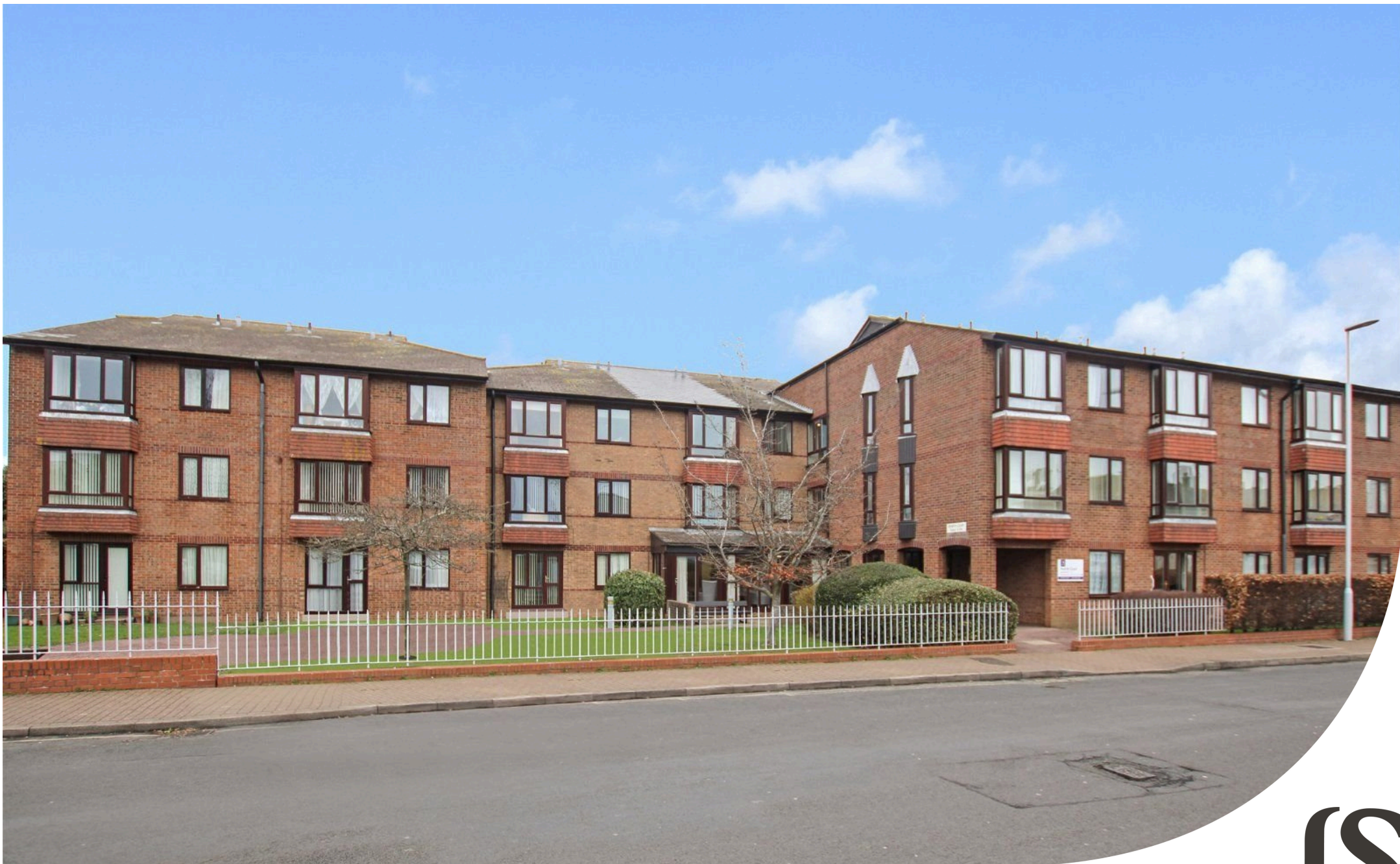
Penrith Court | Broadwater Street East | Worthing | BN14 9AN Offers In the Region of £82,000