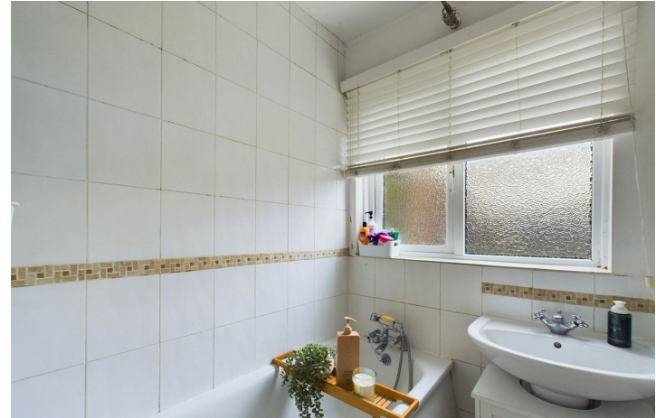
Property details: Gainsborough Avenue | Worthing | BN14 8QR