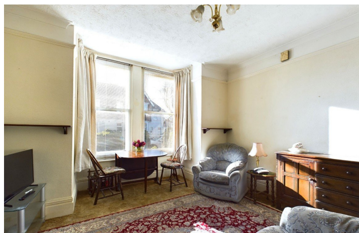
Property details: Shelley Road | Worthing | BN11 1TU