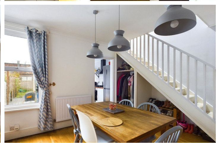
Property details: Becket Road | Worthing | BN14 7ET