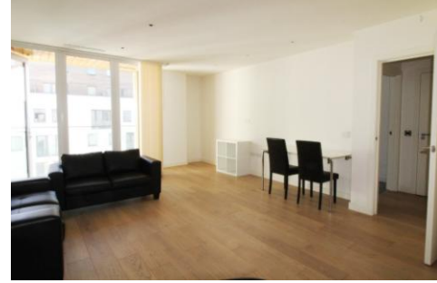
Capitol Way, London £1,200 pcm %tenure%