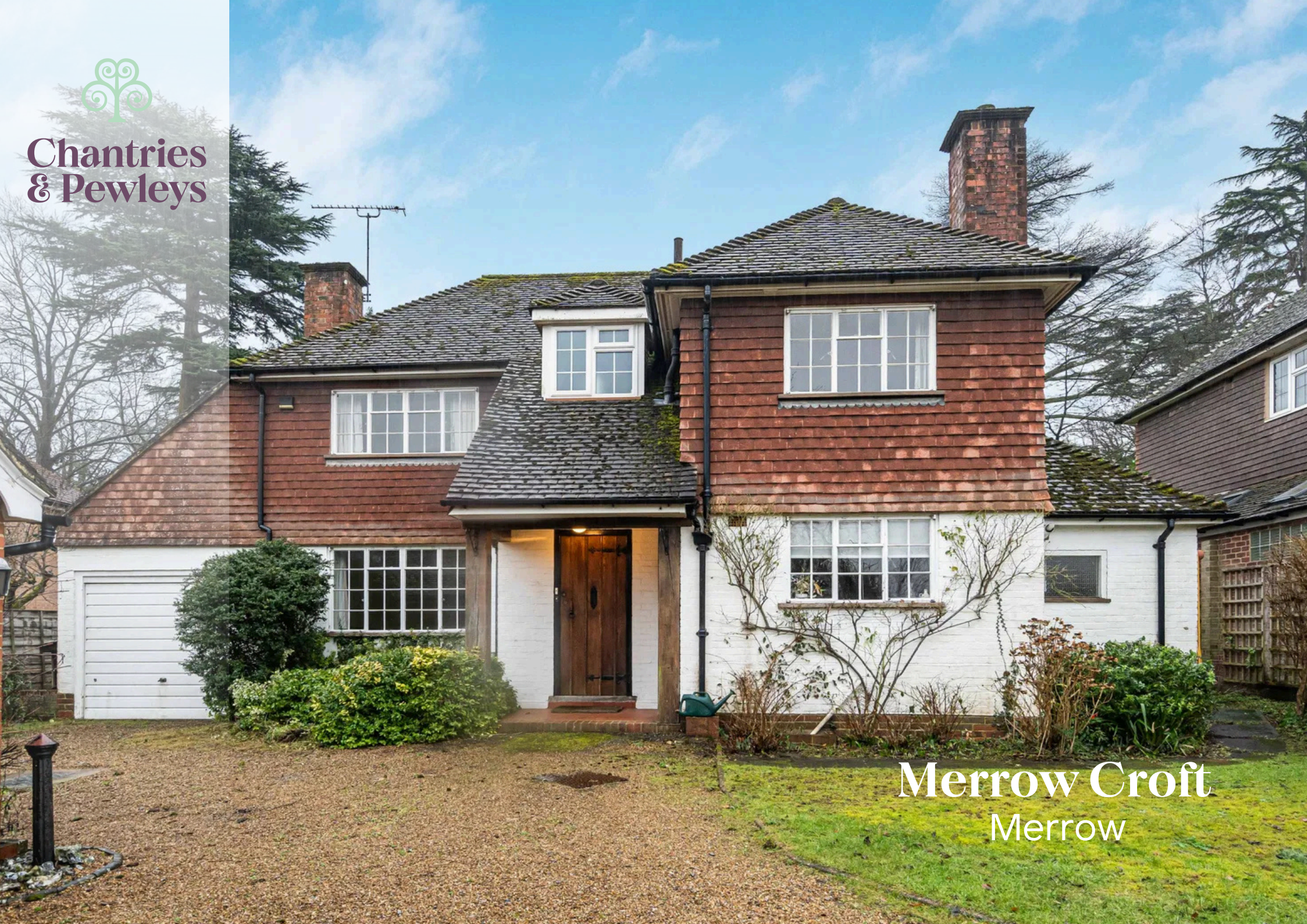
Merrow Croft Merrow