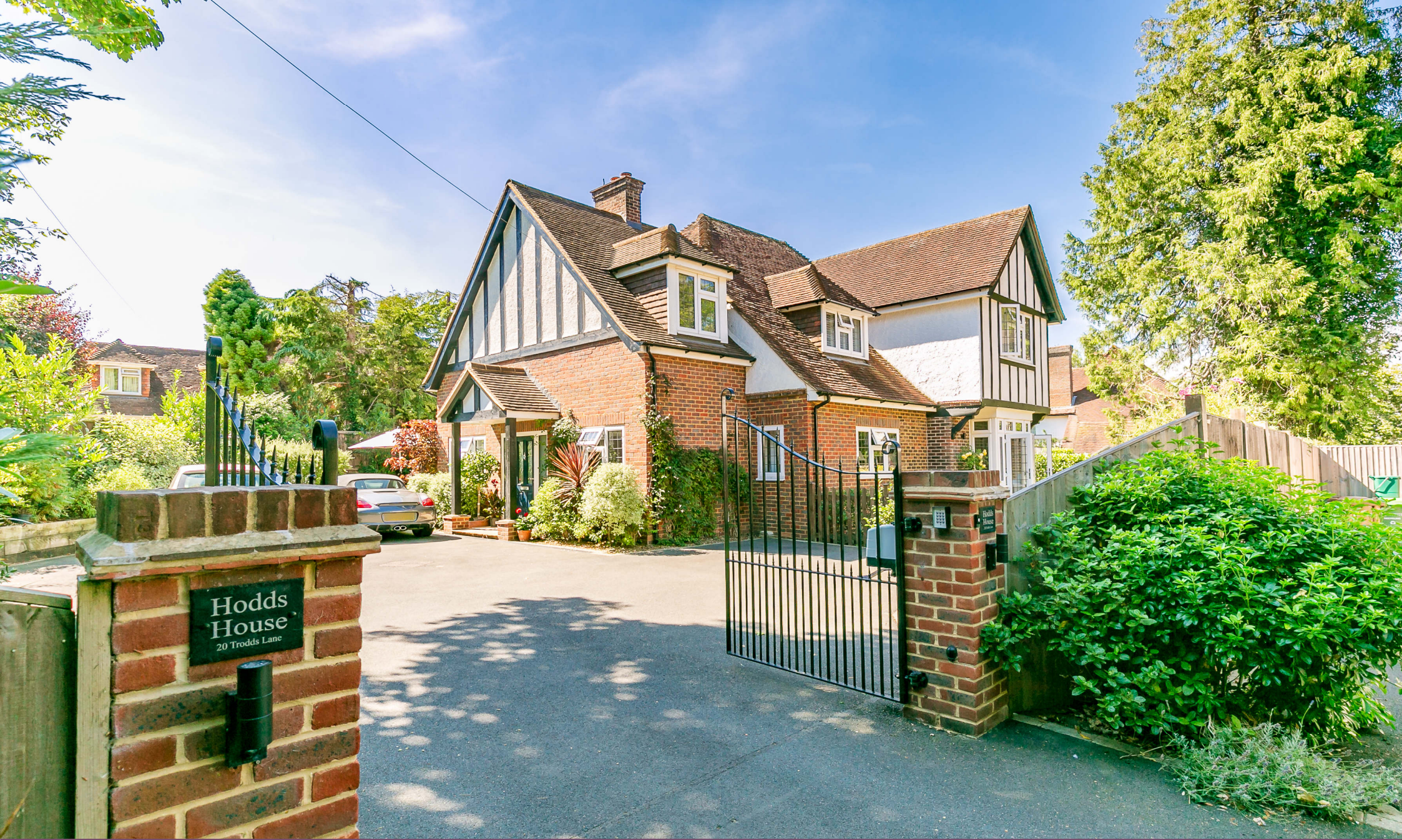
Hodds House, Trodds Lane, Merrow, Guildford, Surrey, GU1 2XR