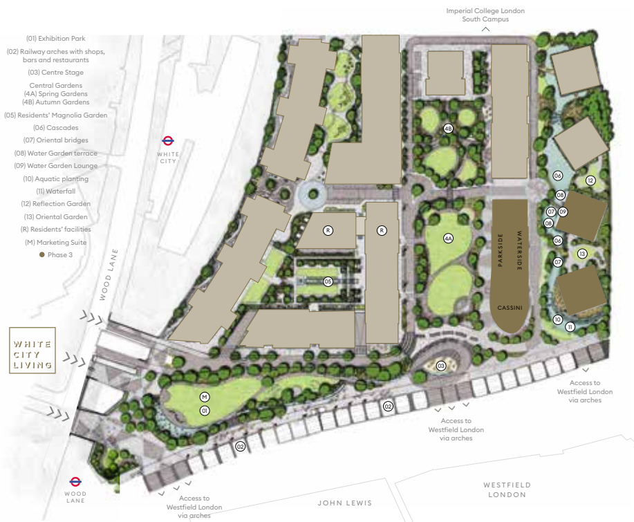
Map for illustration purposes only, not to scale. Source tfl.gov.uk 2016 from W12 7RQ or White City/Wood Lane Stations.

academics and researchers, alongside established businesses and start ups, pushing the boundaries of science and technology. Television Centre, the home of BBC Worldwide, forms a major new business district dedicated to the creative industries including a 45-room hotel, White City House and Bluebird Café among others.