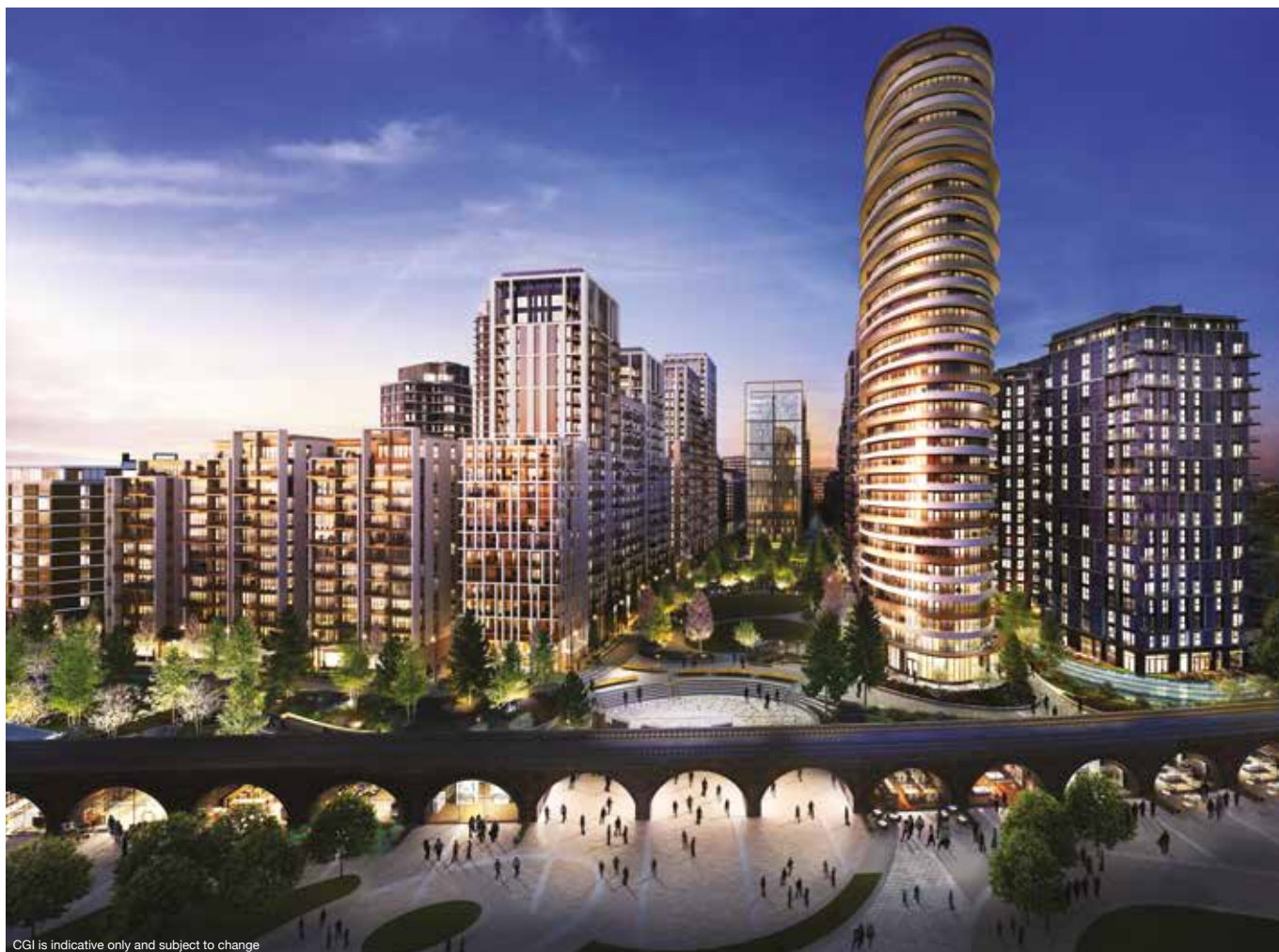
CGI is indicative only and subject to change