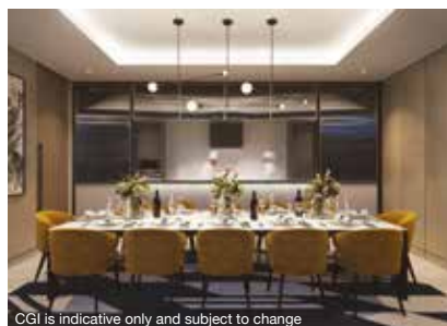
CGI is indicative only and subject to change