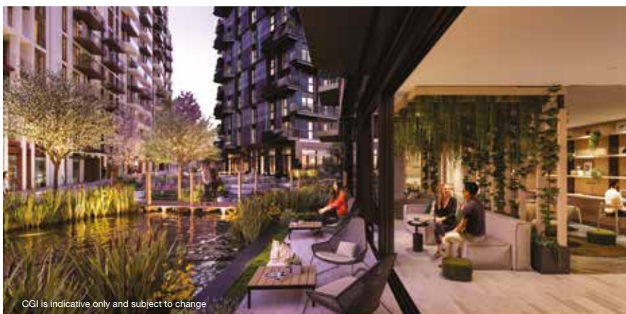
CGI is indicative only and subject to change