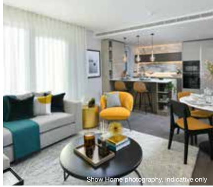
Show Home photography, indicative only