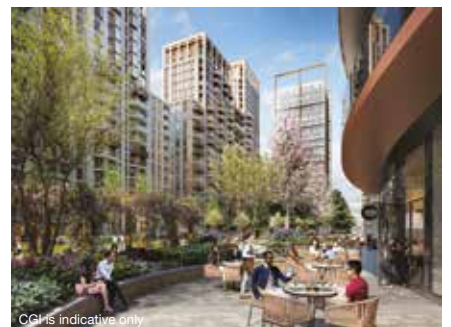
CGI is indicative only.

The White City Opportunity Area is bringing 6,000 new homes and over 20,000 new jobs within the next five years. Some of the world's greatest brands in retail, media and education are transforming the site. At the centre of all this lies White City Living by St James.