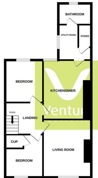
FIRST FLOOR FLAT

Whilst every attempt has been made to ensure the accuracy of the floorplan contained here, measurements of doors, windows, rooms and any other items are approximate and no responsibility is taken for any error, omission or misstatement. This plan is for illustrative purposes only and should be used as such for any prospective purchase. The architect, system and appearance of items used are deemed correct and no guarantee as to their operability or efficiency can be given. Made with Mapplan CS2025