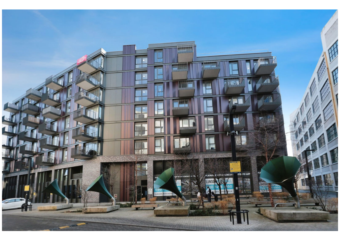
4th FLOOR - ONE BEDROOM - ONE BATHROOM - LIFT ACCESS - LEASEHOLD - CHAIN FREE -MODERN - COMMUNAL GARDEN - BALCONY - ELIZABETH LINE

Henry Wiltshire are please to present this modern property located on Gramophone Lane which sets within reach of the peaceful Grand Union Canal Walk. This 1 bedroom apartment boasts an open-plan layout complemented by stylish interiors. Its contemporary design further benefits from a private terrace with ample room for outdoor seating. Powerhouse Lane is situated in a lovely location with easy access to amenities, choice schools, and the vast Lake Farm Country Park. The Thames and the Grand Union Canal Walk are within reach, as are numerous bus stops and Hayes & Harlington station.