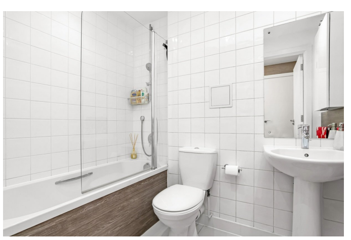
TWO BEDROOM - ONE BATHROOM - 7TH FLOOR - LIFT ACCESS - LEASEHOLD

Henry Wiltshire are proud to present this Large luxury Two-bedroom apartment situated adjacent to Hayes and Harlington station. This apartment is perfect for those wishing to commute. The apartment compromises of a Large lounge, open-plan fully fitted luxury kitchen and huge double bedrooms, one family bathroom. Benefits include a large storage room, Double glazing, Security entry system, Allocated parking, and lift access to floor. Henry Wiltshire are proud to present this Large luxury Two-bedroom apartment situated adjacent to Hayes and Harlington station. This apartment is perfect for those wishing to commute. The apartment compromises of a Large lounge, open-plan fully fitted luxury kitchen and huge double bedrooms, one family bathroom. Benefits include a large storage room, Double glazing, Security entry system, Allocated parking, and lift access to floor.