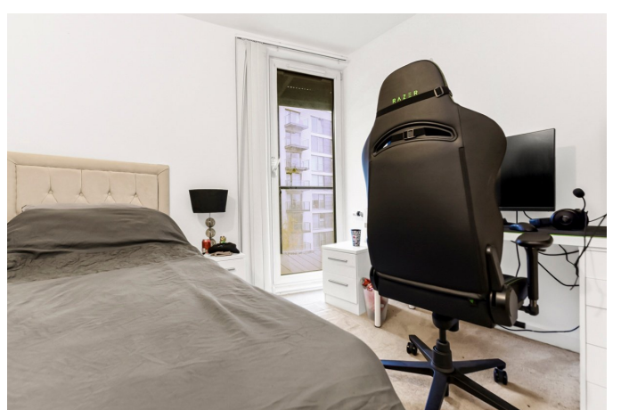
THREE BEDROOM - TWO BATHROOM - CONCIERGE - GYM - SWIMMING POOL - ALLOCATED PARKING

Henry Wiltshire are pleased to present this Three bedroom, Two bathroom luxury apartment situated in the popular High Point Village development adjacent to Hayes and Harlington train station. Offering spectacular views over North West London. Gymnasium and swimming pool. A commuters paradise. Accommodation; Three bedrooms (with luxury en-suite bathroom), Further luxury bathroom, Fully fitted kitchen with appliances, Lounge with floor to ceiling windows offering spectacular views. Benefits; A Concierge, Gymnasium, Swimming pool, Double glazing, Gas central heating, Entry-phone system.