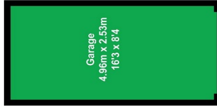
Garage Approx. Floor Area 12.50 Sq.M. (135 Sq.Ft.)