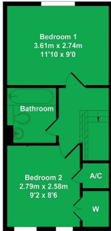
First Floor Approx. Floor Area 27.60 Sq.M. (297 Sq.Ft.)

Total Approx. Floor Area 594 Sq.Ft. (55.20 Sq.M.)