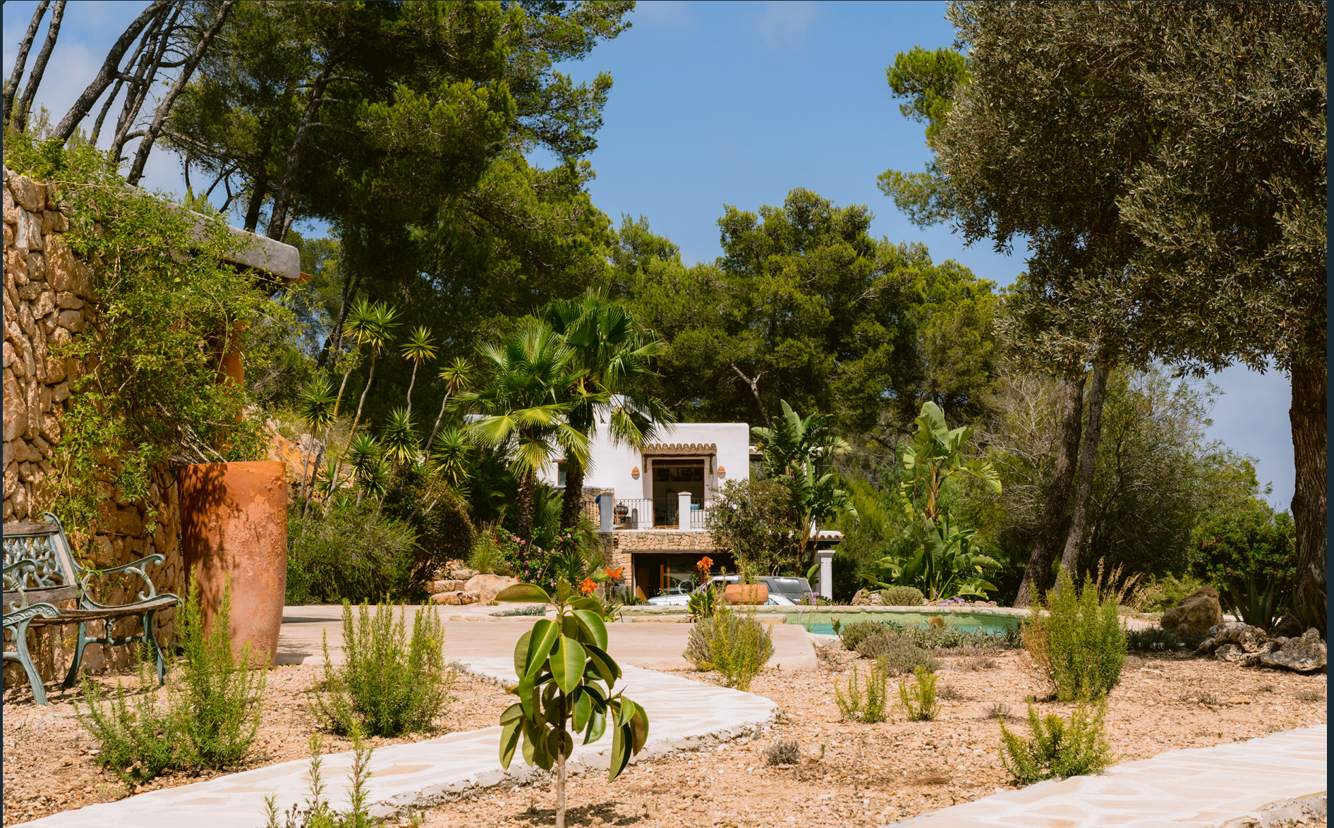
Can Falco, North East Ibiza €2.850.000