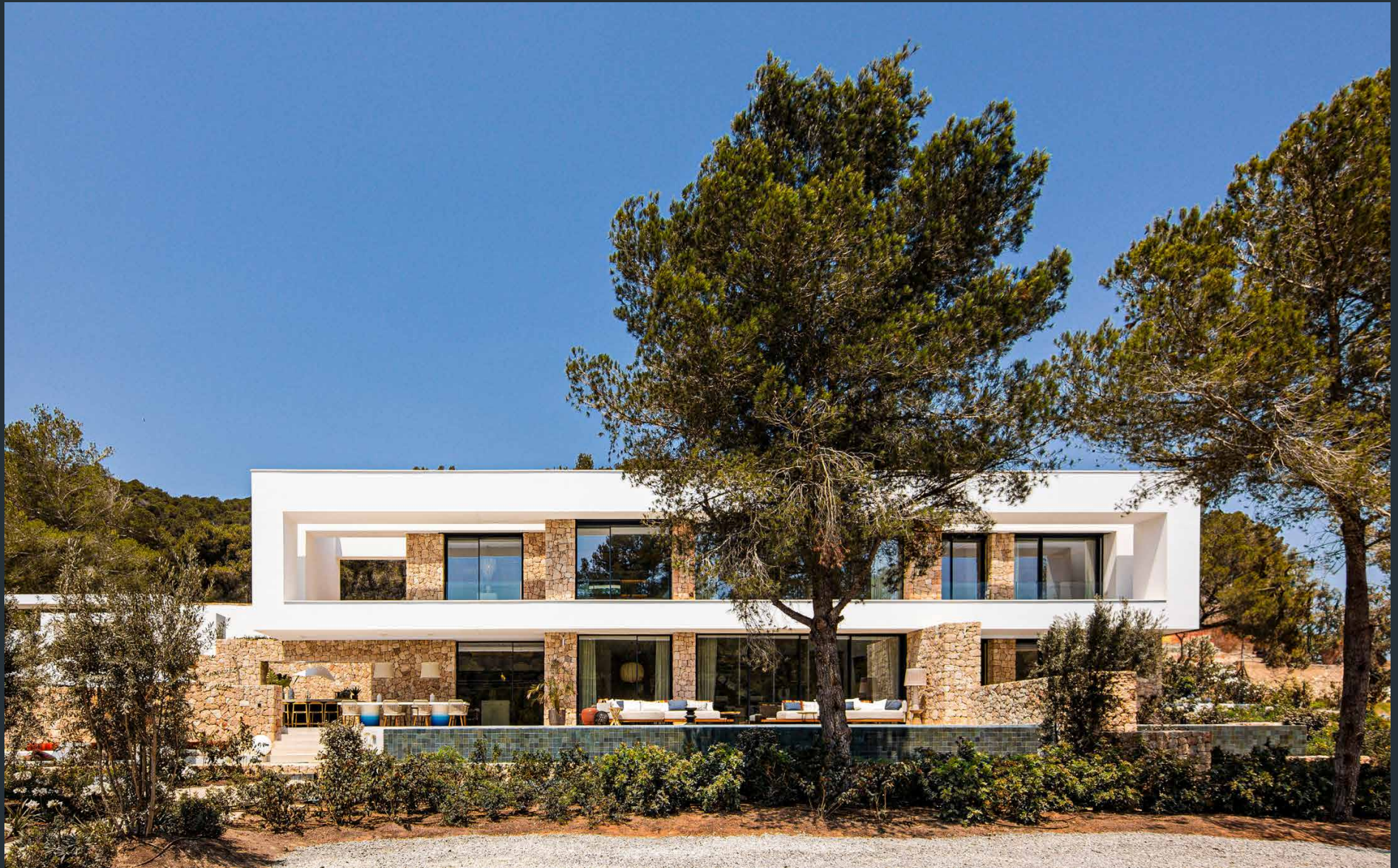
Villa Coral A, Roca Lisa €4.600.000