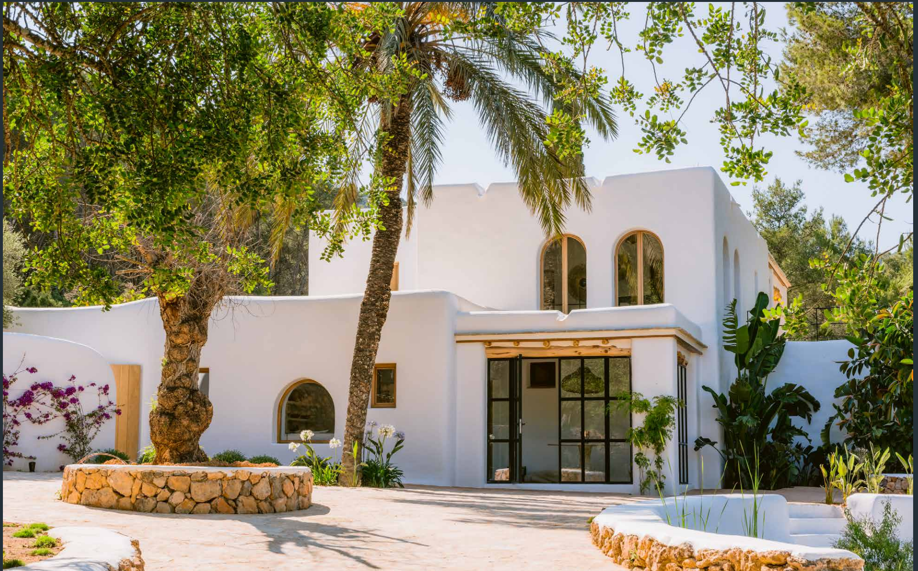
Finca Mirabelle, South Ibiza €5.000.000