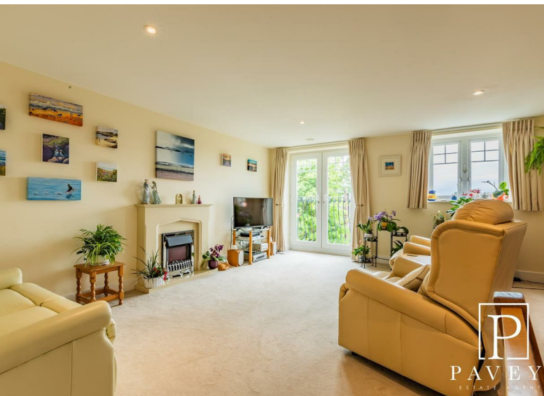
GROUND FLOOR 1172 sq.ft. (108.9 sq.m.) approx.

NO ONWARD CHAIN! Paveys have the pleasure in offering for sale this LIGHT, AIRY & SPACIOUS MCCARTHY & STONE SECOND FLOOR APARTMENT located in the heart of Frinton-on-Sea. VICTORIA GARDENS is an exclusive retirement apartment complex constructed in 2016 and set in beautiful established gardens with an attractive residents club Lounge, lift to all floors, video door entry system, 24 hour emergency call system, house manager (Monday to Friday) and allocated parking. This spacious apartment features a large lounge diner with French doors to the Juliet Balcony which has a stunning SOUTH WESTERLEY orientation and benefits from partail SEA VIEWS, study area, modern kitchen with integrated appliances, master bedroom with en-suite shower room and large walk-in wardrobe, second double bedroom, modern shower room, large walk-in utility room and under floor heating. The property occupies a central location within easy reach of the greensward, beach, shops and rail services. An internal viewing is highly recommended. Call Paveys today to arrange a viewing.