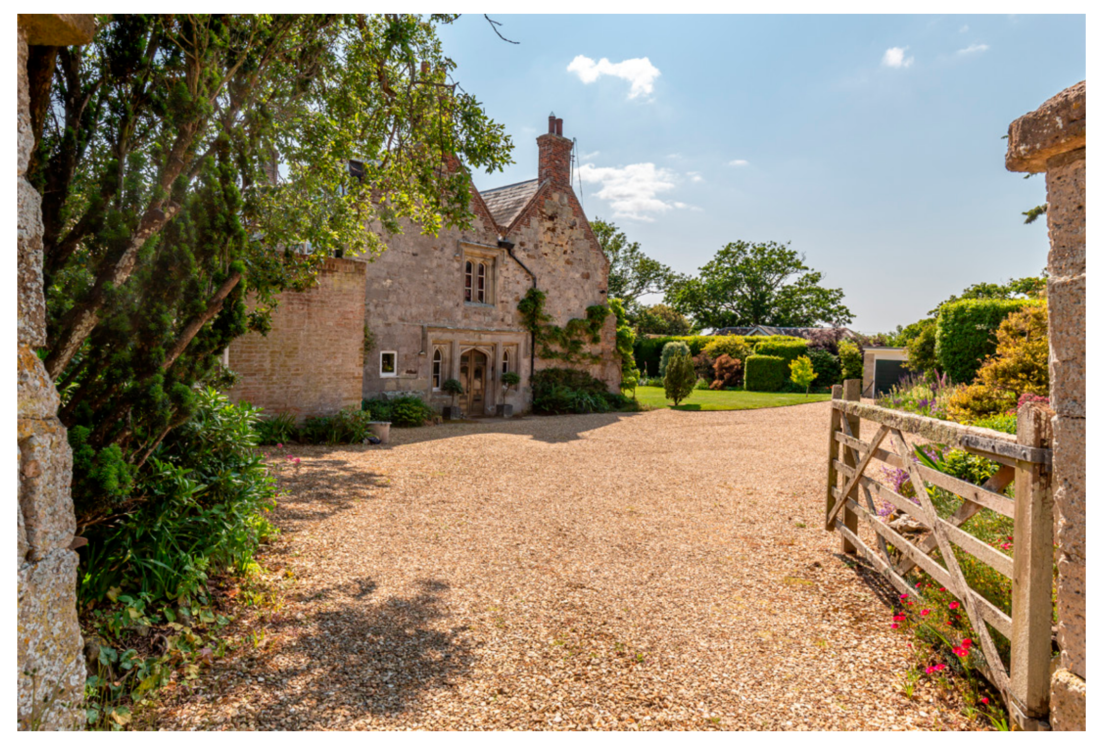
RURAL CONSULTANCY | SALES | LETTINGS | DESIGN & PLANNING