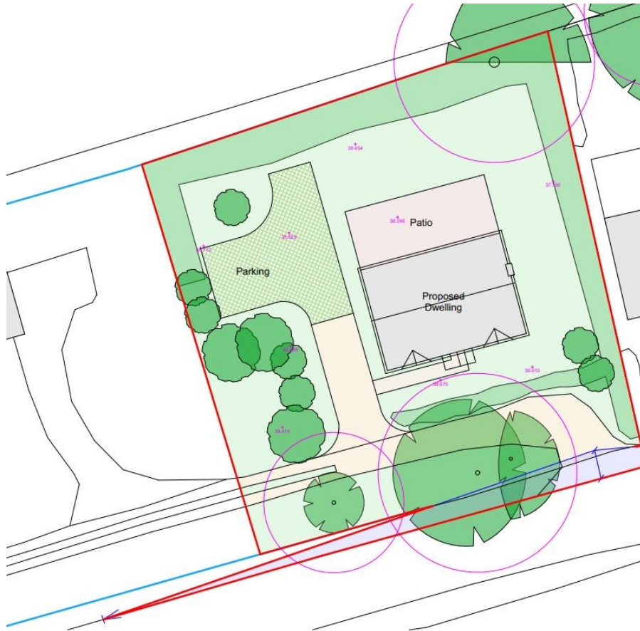
PROPOSED SITE LAYOUT (Planning Illustration) Not to scale