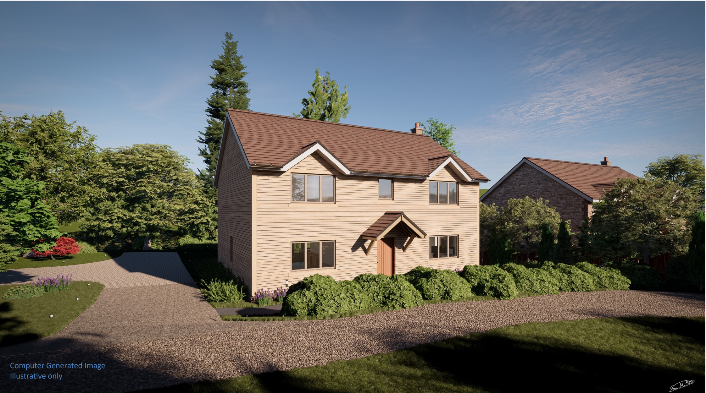
Computer Generated Image Illustrative only