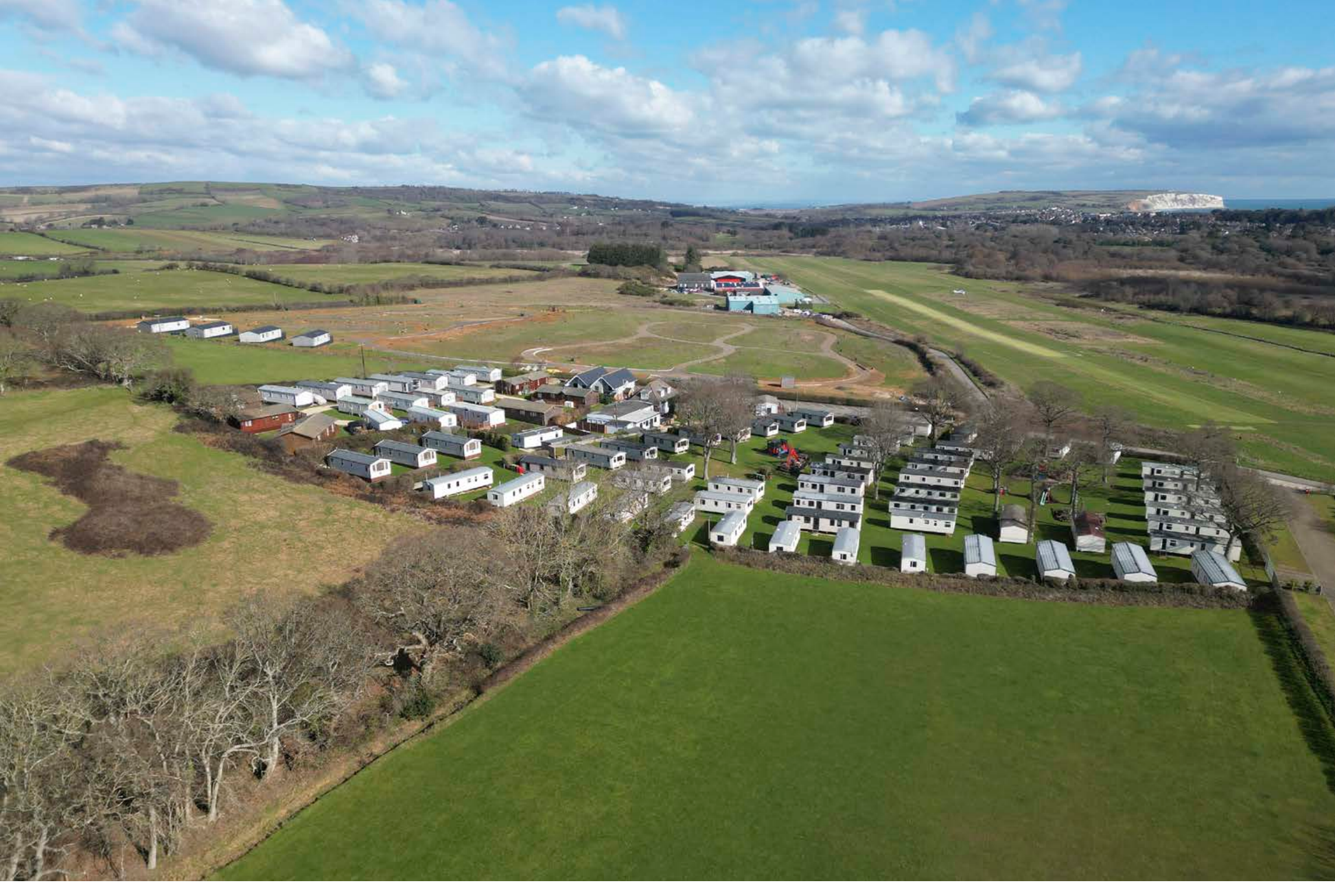
RURAL CONSULTANCY | SALES | LETTINGS | DESIGN & PLANNING