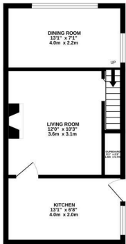
GROUND FLOOR 345 sq.ft. (31.9 sq.m.) approx.