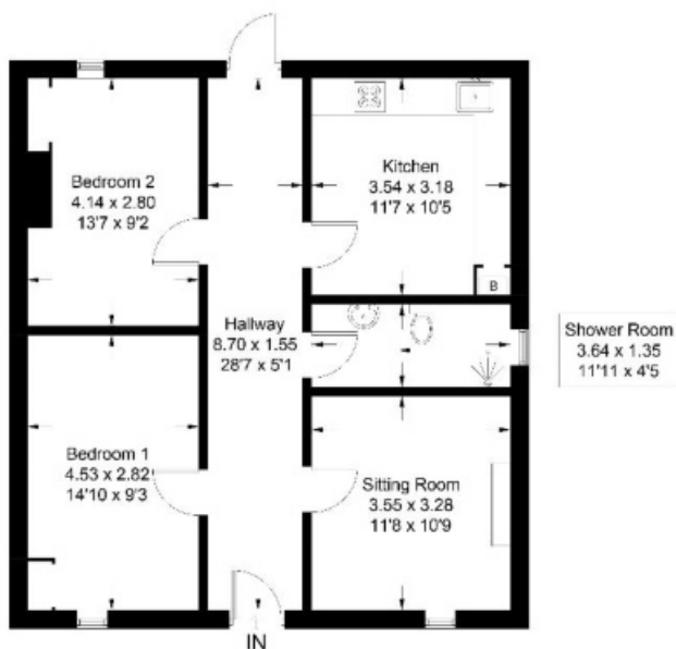
Illustration for identification purposes only, measurements are approximate, not to scale. floorplans4usketech.com © (1D1081316)

Approximate Gross Internal Area = 67.85 sq m / 730 sq ft