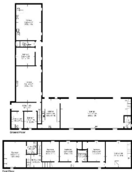
Illustration for identification purposes only, measurements are approximate, not to scale. floorplans4sketch.com © (ID1076220)

Approximate Gross Internal Area = 370.2 sq m / 3985 sq ft