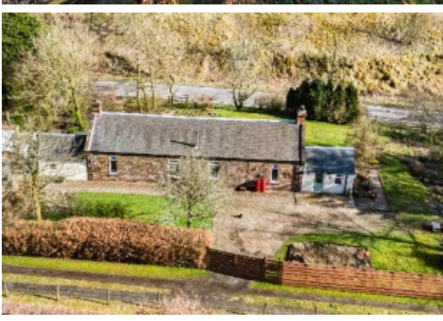
Signal Box Cottage, Whitrope, Hawick, TD9 9TY

Approximate Gross Internal Area = 109.1 sq m / 1174 sq ft