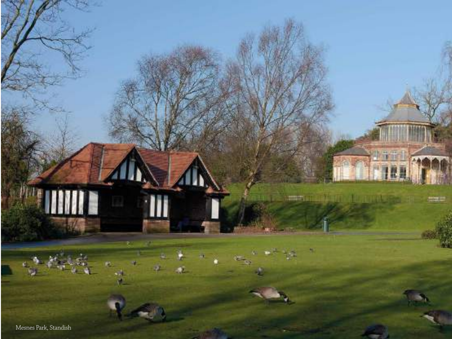
Mesnes Park, Standish

If golf is your game, you will be spoilt for choice. You could become a member of the Historic Wigan Golf club that is referred to as the Hidden Gem.