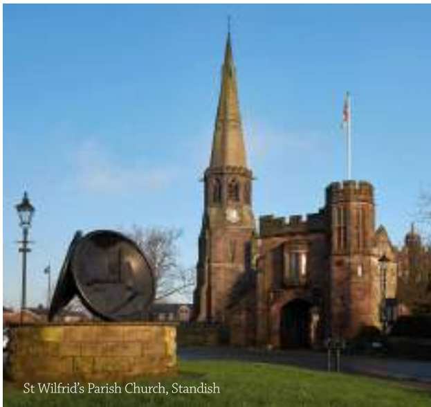
St Wilfrid's Parish Church, Standish

Offering the best of both worlds, with beautiful new homes in Standish, located in the picturesque Lancashire countryside, just minutes away from junction 27 of the M6 motorway, with excellent schools, this is the perfect place to raise a family.