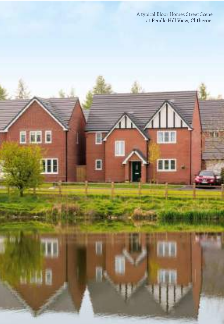
A typical Bloor Homes Street Scene at Pendle Hill View, Clitheroe.