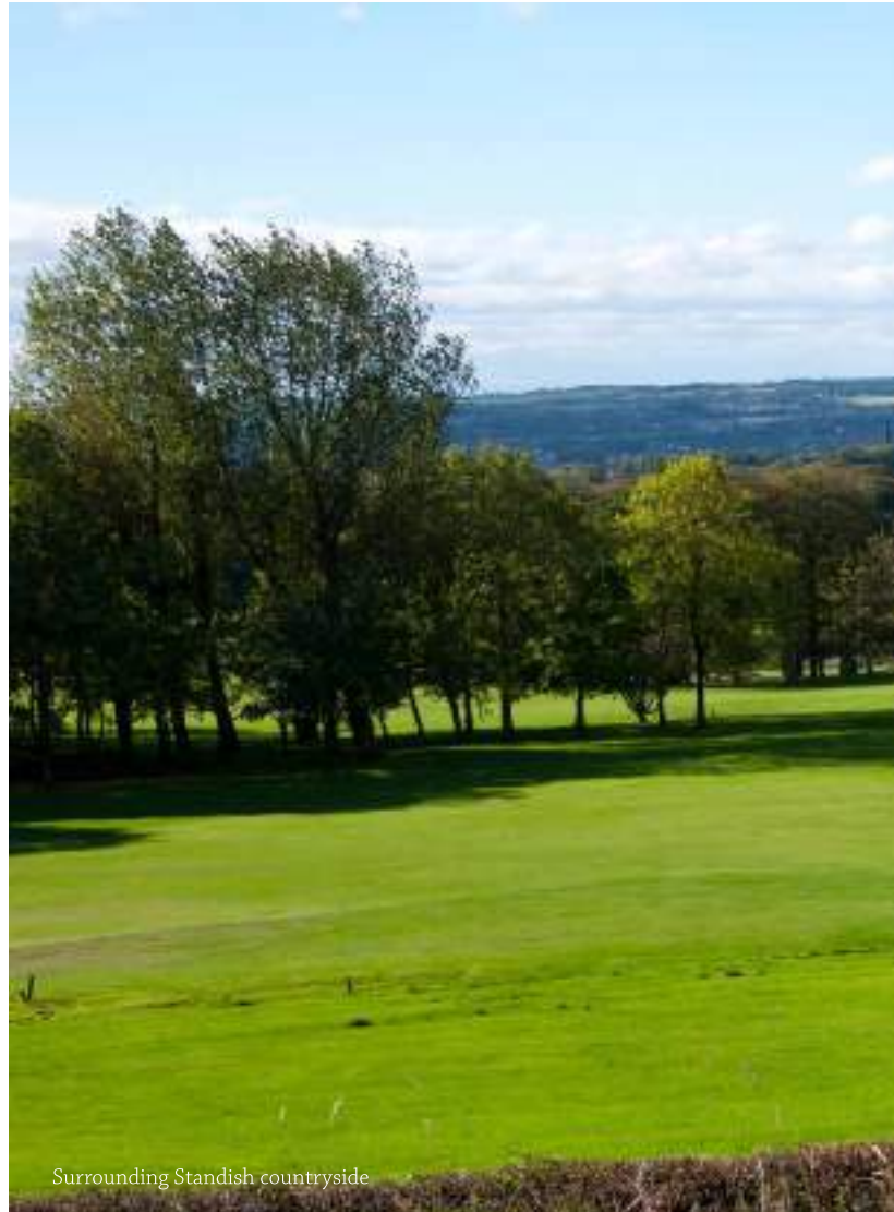
Surrounding Standish countryside

Here, Bloor Homes is creating a range of beautiful 2, 3 and 4 bedroom mews, semi-detached and detached family homes, with something to suit everyone. Singles and couples, young families and those with older children, commuters, downsizers and everyone who enjoys the finer things in life. With our focus on energy-efficient design, traditional craftsmanship, attention to detail, and - above all - excellent customer service, this really is the place to find your perfect new home.