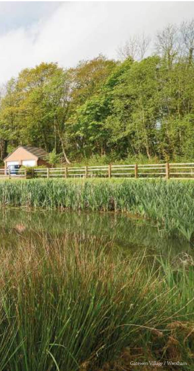
Gatewen Village / Wrexham

Our approach to the design of every new location we produce goes far beyond the provision of superior homes for today's varied lifestyle. We make every effort to conserve the natural balance of each location including the conservation of wildlife and the preservation of natural features. Care and consideration is taken to ensure that the environmental impact of every new Bloor home is kept to a minimum.