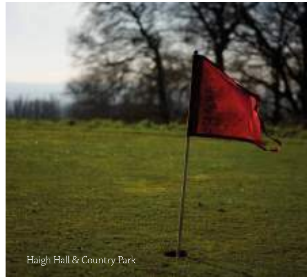
Haigh Hall &amp; Country Park