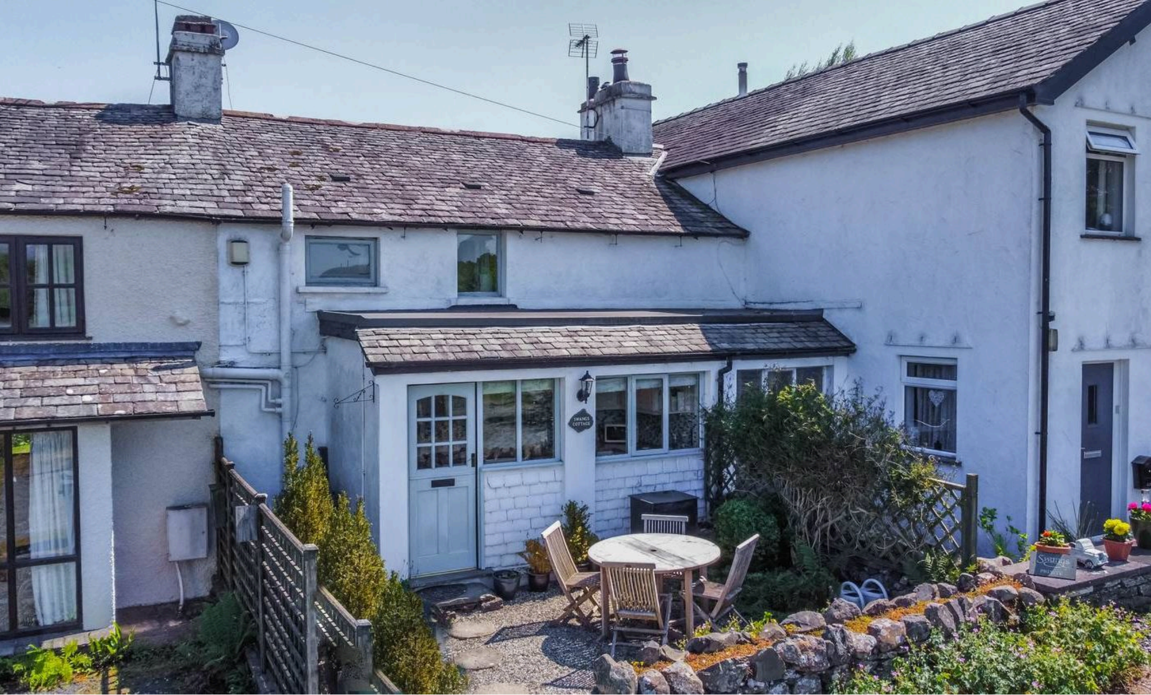
Swangs Cottage, Lowick Green £325,000