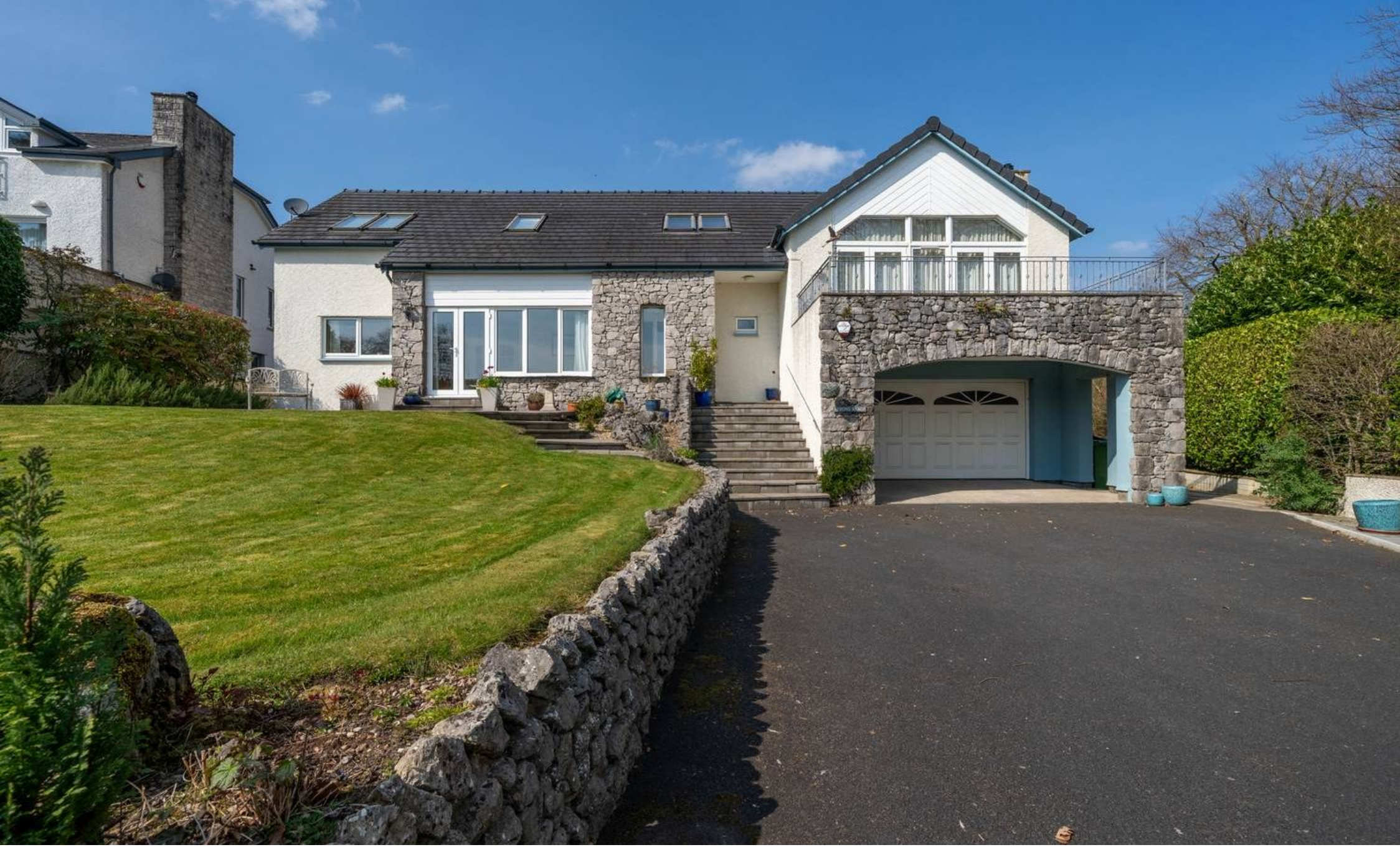
51 Carter Road, Grange-Over-Sands £650,000