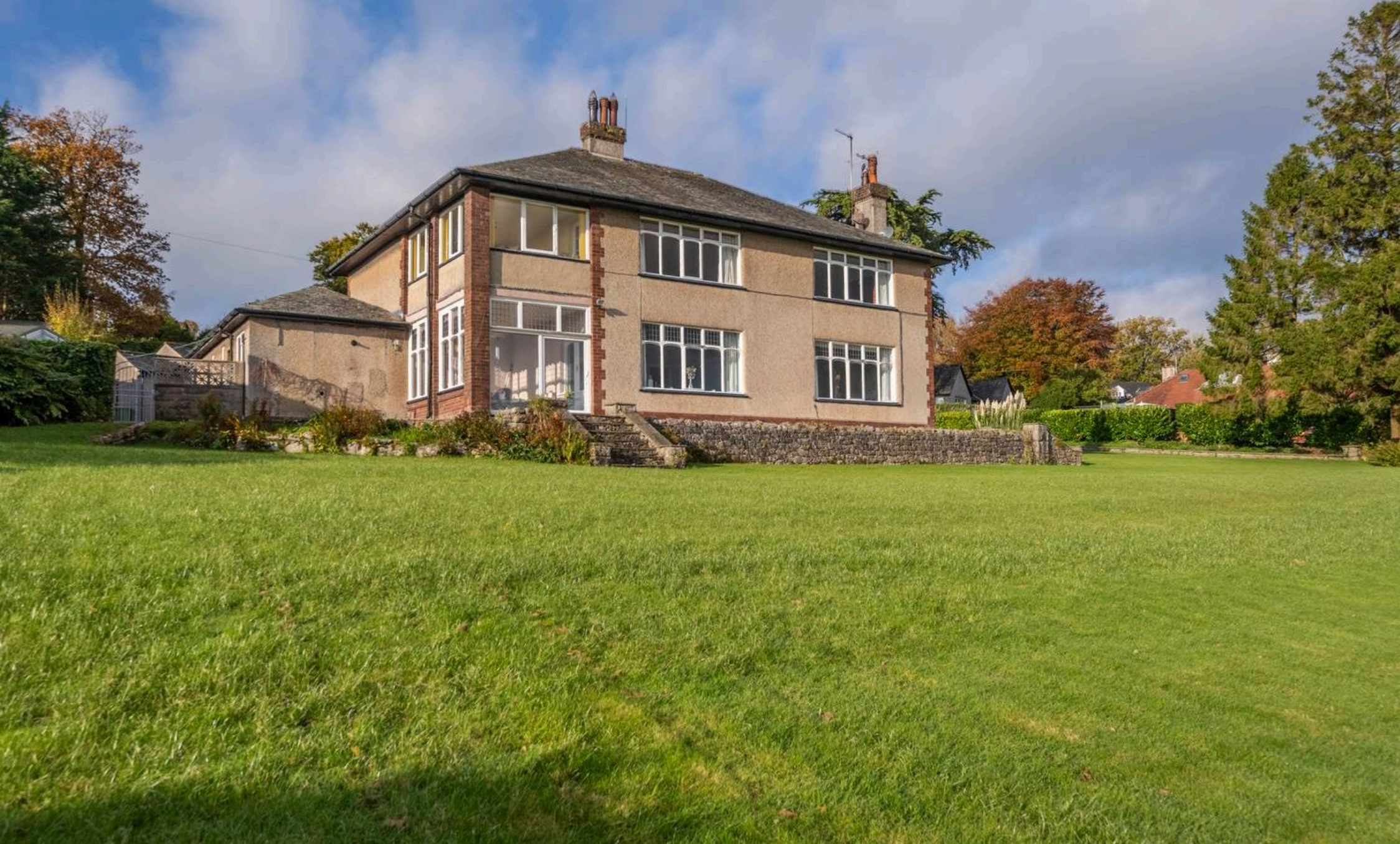
Fox Rock Allithwaite Road, Grange-Over-Sands £850,000